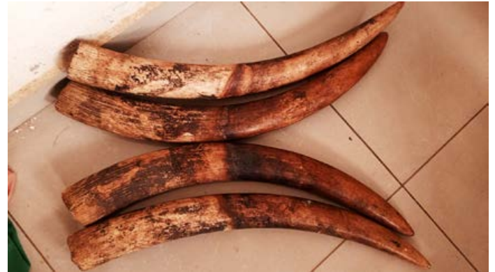
4 traffickers arrested with 4 elephant tusks in Cameroon.

PALF initiated the legal procedure for a trafficker arrested on murder charges with elephant parts. The