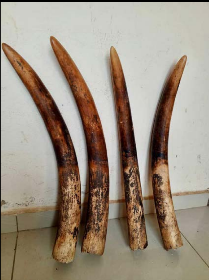
4 traffickers arrested with 4 elephant tusks in Cameroon.