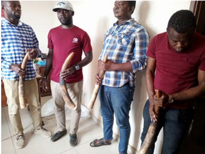
4 traffickers arrested with 4 elephant tusks in Cameroon.

5 ivory traffickers arrested with 2 huge elephant tusks weighing over 60 kg in Côte d'Ivoire. The traffickers were extremely careful pulling many tricks to avoid getting caught till their eventual arrest. Two of the traffickers attempted to escape but were quickly apprehended. The tusks were probably from of a forest elephant from Tai National Park. The elephant tusks were dug out from a field where the traffickers had hidden them.