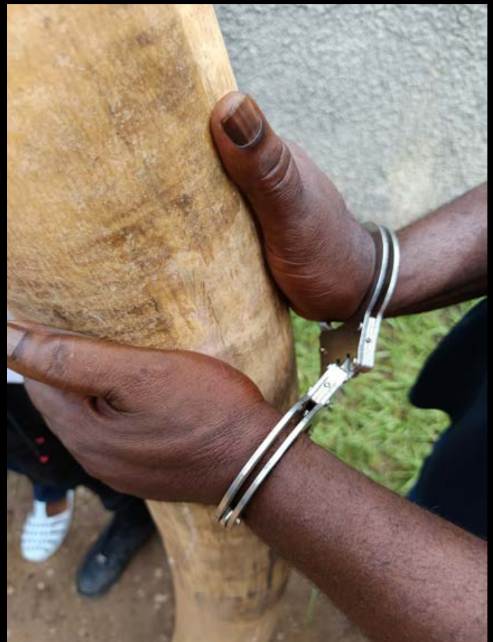
5 ivory traffickers arrested with 2 huge elephant tusks weighing over 60 kg in Côte d'Ivoire.