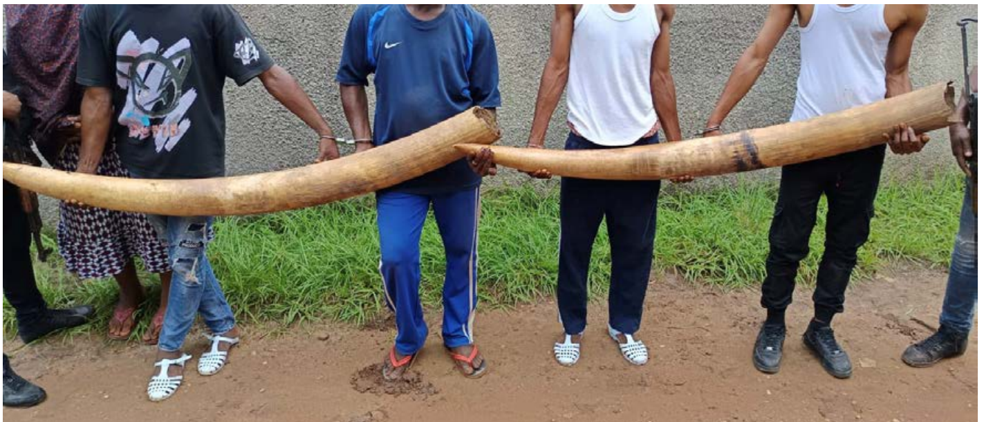
5 ivory traffickers arrested with 2 huge elephant tusks weighing over 60 kg in Côte d'Ivoire.

trafficker is a former rebel in the Congo Democratic Republic and was found in possession of a bag containing elephant feet and hair. He took the arresting team to the spot where the elephant was killed in the forest. The murder charges were dropped while his trial for wildlife crime continues.